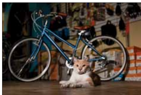
Sprocket, The Hub’s shop cat, greets customers needing repairs or a looking for a new or used bike.

off for The Hub, as they have attracted a diverse clientele, and business has steadily increased for the hands-on owners.